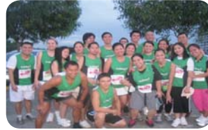
DLSU 8 th Animo Run, November 2010

IntelliCare formed a Marathon Team called I-RUN in November 2010 to promote running as a means of life-long health activity and fitness program for people of all ages and level of ability.